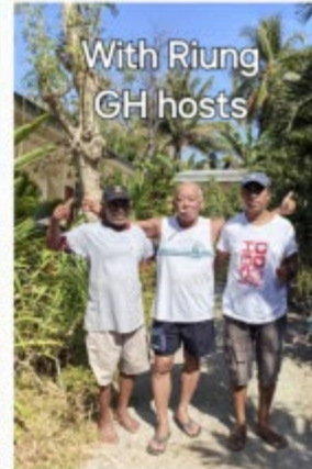
With Riung GH hosts

DAY 4 BAJAWA-MONI (173KM) Set off on an adventurous road trip from Bajawa to Moni, with exciting stops along the way. Begin at Mangeruda Hot Springs , where you can soak in the natural thermal pools, surrounded by lush greenery for a refreshing experience. Next, visit Pantai Batu Biru , a beautiful beach known for its crystal-clear waters and unique blue stones. Here, you can relax on the sandy shore or take a swim, and don't miss the opportunity to savor delicious grilled fish and calamari from local vendors while enjoying the stunning ocean views. As