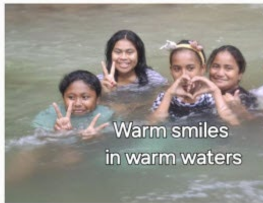
Warm smiles in warm waters