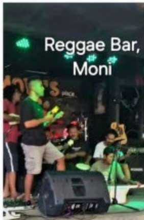
Reggae Bar, Moni