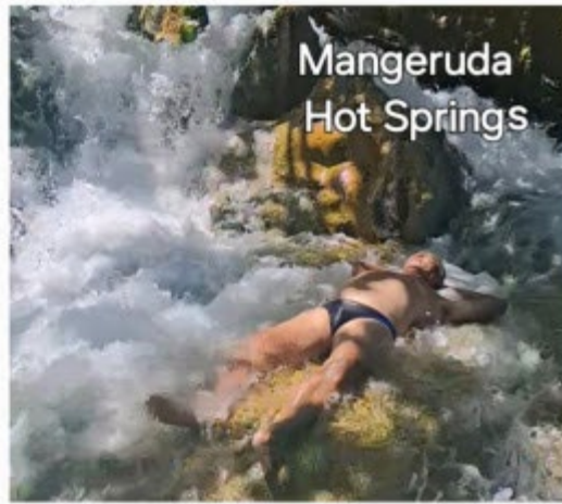
Mangeruda Hot Springs